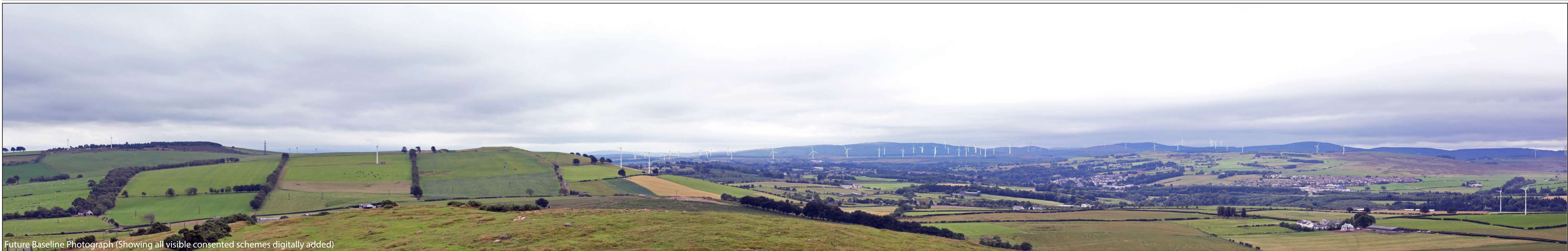
Future Baseline Photograph (Showing all visible consented schemes digitally added)