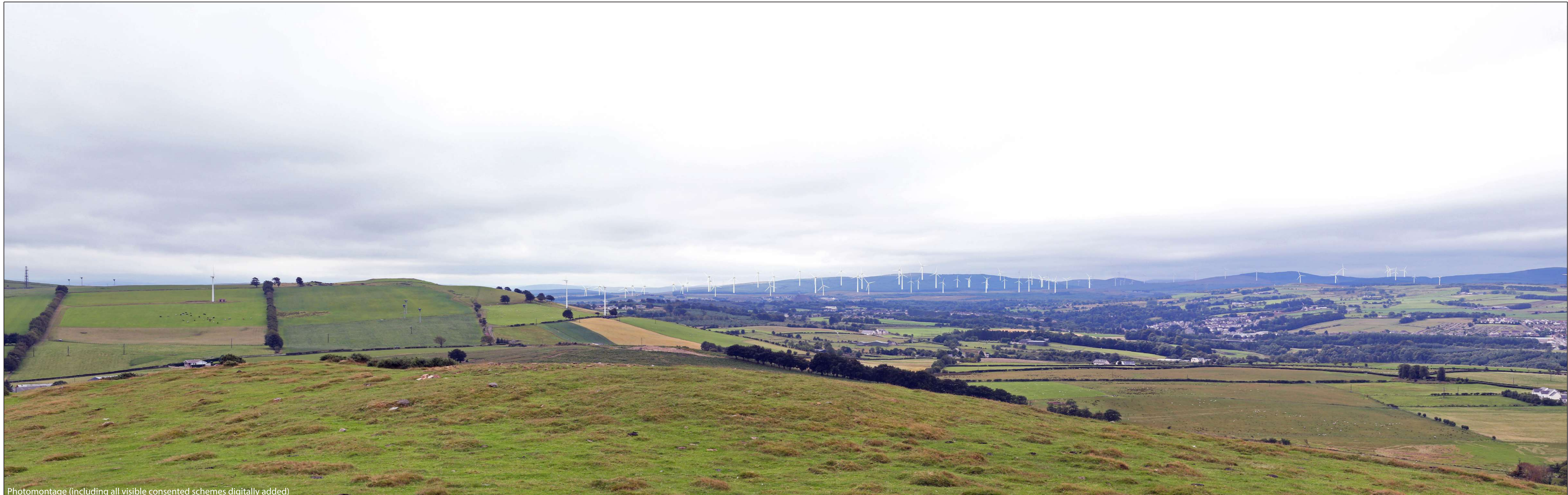
Photomontage (including all visible consented schemes digitally added)