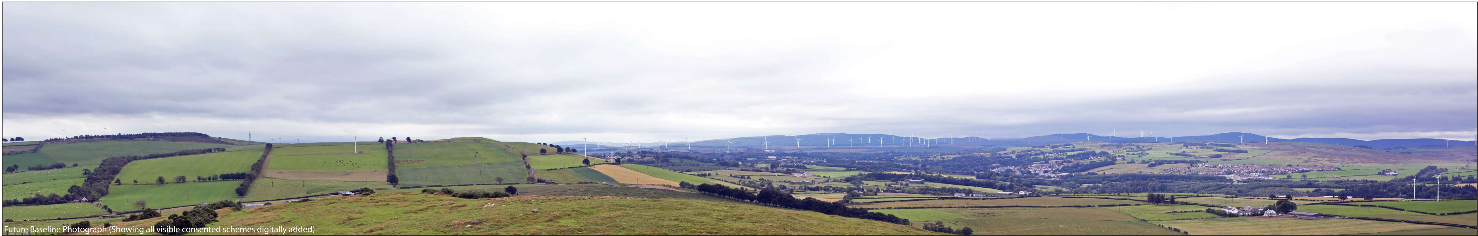
Future Baseline Photograph (Showing all visible consented schemes digitally added)